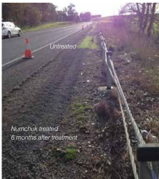
Peracto Trial: Sassafras, Tasmania, 2013-14