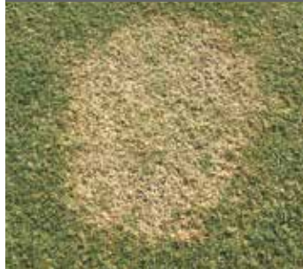
Spring Dead Spot