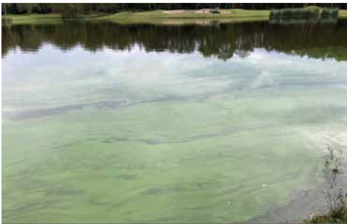
Planktonic (Free Floating) Algae