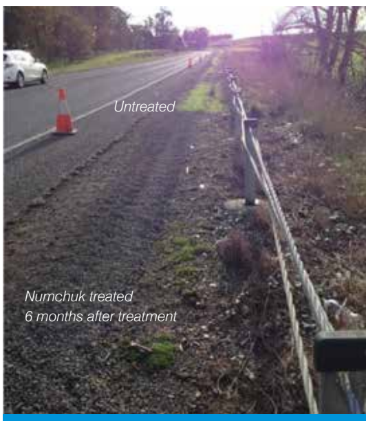
Peracto Trial: Sassafras, Tasmania, 2013-14