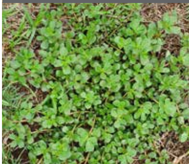
Pigweed – Portulaca oleracea