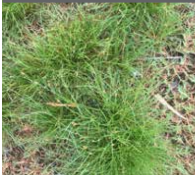
Toad Rush – Juncus spp.