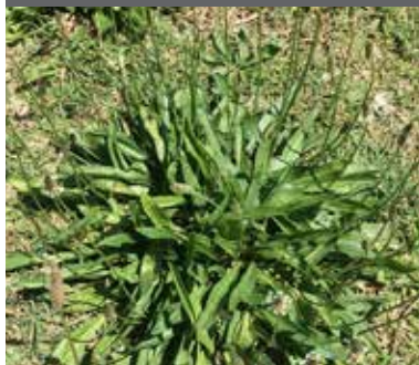
Plantain – Plantago lanceolata