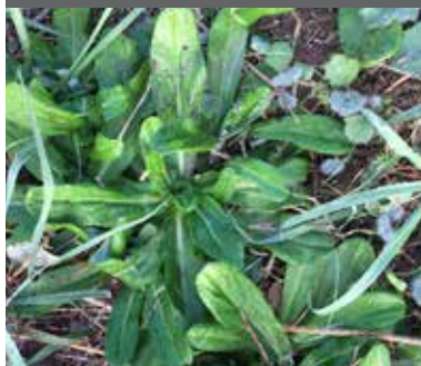
Cudweed – Gamochaeta spp.