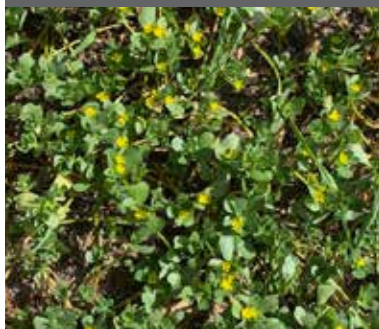
Burr Medic – Medicago spp.