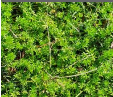
Bindii – Soliva sessillis