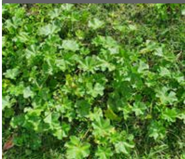
Mallow – Malva parviflora