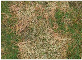
Red Thread ( Laetisaria fuciformis )