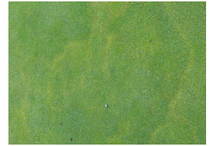
Take All Patch ( Gaeumannomyces graminis var. avenae )