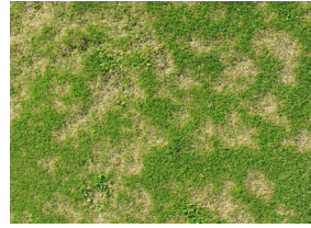
Dollar Spot ( Sclerotinia homoeocarpa )