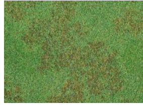
Curvularia ( Curvularia spp.)