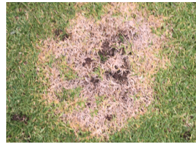
Fusarium (Winter) Microdochium nivale