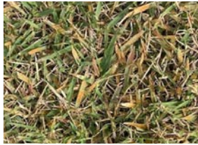
Rust ( Puccinia spp.)