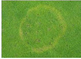
Brown Patch ( Rhizoctonia solani )