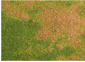
Anthracnose ( Colletotrichum spp.)