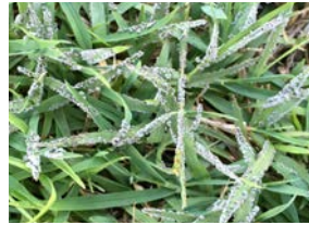
Slime Mould ( Mucilaga or Physarum spp.)