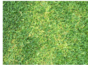
Leptosphaerulina Leaf Blight ( Leptosphaerulina australis )