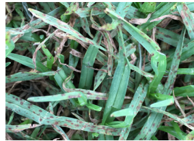
Helminthosporium (Leaf Spot) Bipolaris spp.