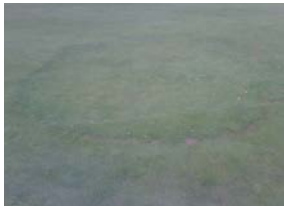
Fairy Ring - Type 1 Basidiomycete Fungi