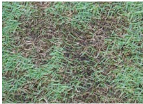
Helminthosporium Complex (Black) Bipolaris , Drechslera & Exserohilum spp.