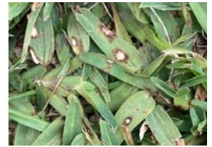
Grey Leaf Spot ( Pyricularia grisea )