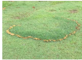
Fairy Ring - Type 3 Basidiomycete Fungi