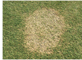
Spring Dead Spot ( Leptosphaeria korrae )