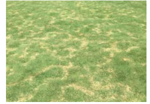
ERI (Ectotrophic Root Infecting Fungi)