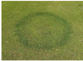
Fairy Ring - Type 2 Basidiomycete Fungi