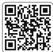
MSDS QR CODE